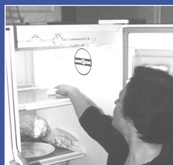
Not just the surface cleaning!