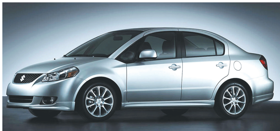
Suzuki unveiled its all-new 2008 SX4 sedan (European spec. shown here) in Geneva and plans to debut the North American version in New York next month.

Customers will have the choice of a five-speed manual transmission or an available four-speed automatic transmission, and can buy the vehicle starting in the fall of this year. Pricing has not yet been announced.