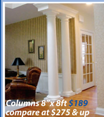
Columns 8" x 8ft $189 compare at $275 & up