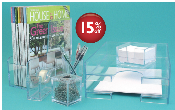
Acrylic Desk Collection $5.99 to $16.99 Sale $5.09 to $14.44