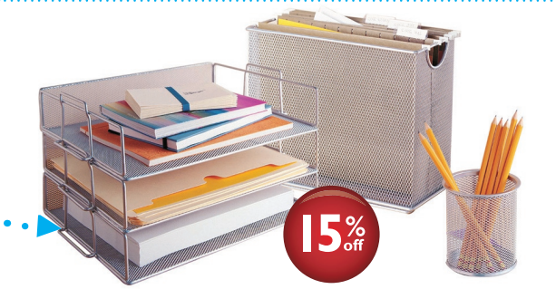
Mesh Desk Organizers $3.99 to $19.99 Sale $3.39 to $16.99