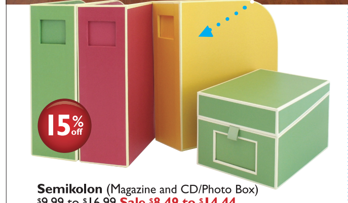
Semikolon (Magazine and CD/Photo Box) $9.99 to $16.99 Sale $8.49 to $14.44