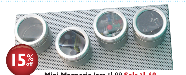
Mini Magnetic Jars $1.99 Sale $1.69