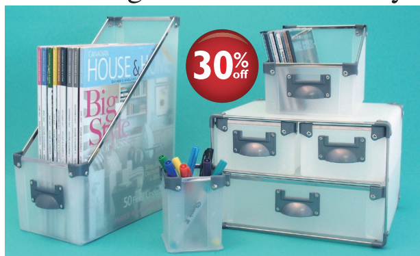
Frost Desk Collection $2.49 to $17.99 Sale $1.74 to $12.59 CD Box, Magazine Holder, Pen Cup and 3 or 4 drawer Storage Box.