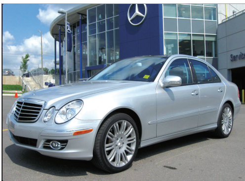
P0502 2007 E350 4Matic Silver, Panorama Sunroof, Premium Package E350/550 Sedan, Rear Side Airbag, Sport Package.