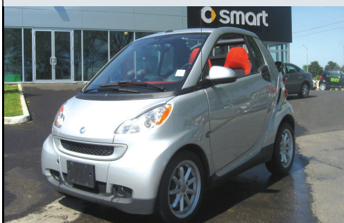
SM9057A 2008 Smart Passion Convertible, Cockpit clock and rev counter, passion Package, lots of fun!