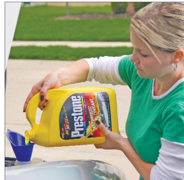
Proper car maintenance goes along way for the survival of your vehicle.

Antifreeze/Coolant. Antifreeze/coolant performs three different functions – specifically, it prevents your cooling system from freezing in the winter, boiling in