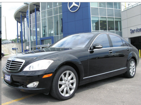
P0493 2007 S550 LWB Black, Heated Steering Wheel, Leather, Sun roof, Navigation sys.