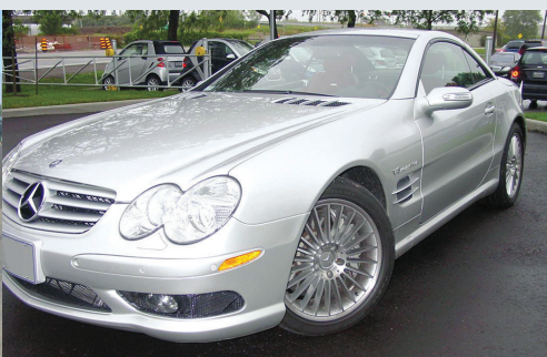
P0521 2004 MB SL55 AMG V8 KOMPRESSOR !!! Very Unique !!!